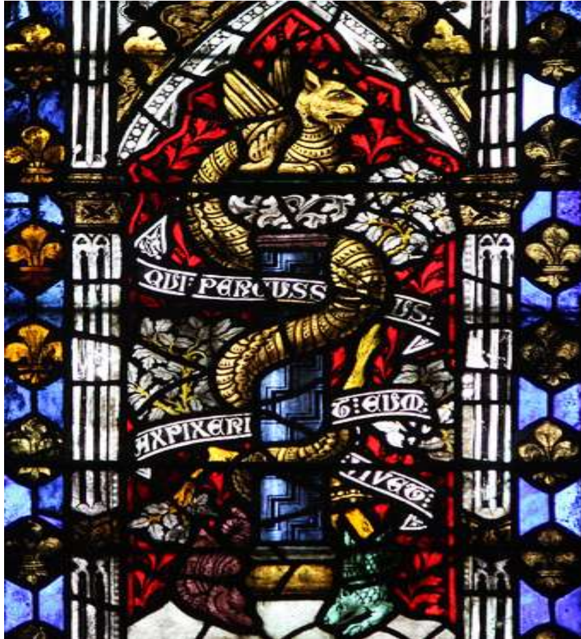
A medieval stained-glass window found in Wells Cathedral in Wells, Somerset, England, that illustrates Numbers 21:9, where Moses mounts a serpent on a pole so that those bitten by snakes could look at it and be healed.

Welcome to worship service at the First Presbyterian Church in Palestine, IL. Whether you are here in person, or watching us online, we are honored that you have chosen to worship with us!